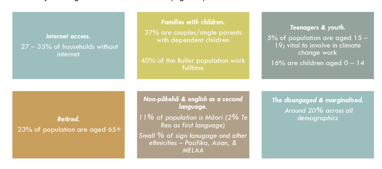
Figure 1: High-level Buller community profile.

Local government knows and understands its communities and its district, including the relationships and networks that exist across iwi, stakeholders, government, and communities, and where each community's strengths and vulnerabilities lie (Figure 1).